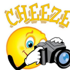
PHOTO DAY AT COOK

so teachers can arrange conferences with families. This year our first early dismissal day will be on Wednesday, October 21st at 12:00 pm . Teachers will have conferences by Zoom or telephone throughout that afternoon and, most likely, other days through the next week as well.